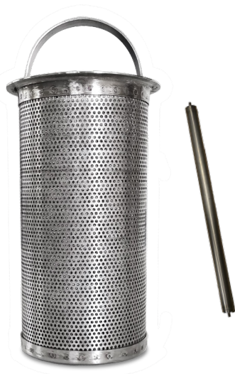
Complete Magnetic Rod and Pleated Basket Assembly