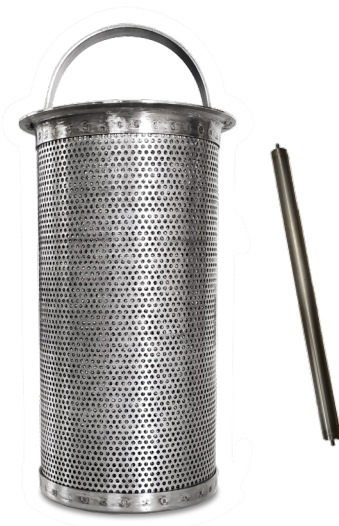
Magnetic spark plug and pleated basket set